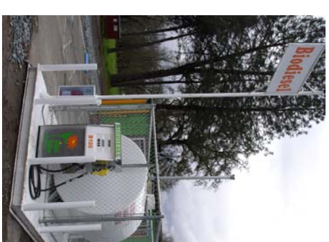
FUELING TANK NOT TO SCALE

DESCRIPTION OF PROJECT: PURE BIODIESEL DISPENSING TO FLEET MEMBERS THROUGH A 1250 GALLON FUELING TANK LOCATED IN THE REAR PARKING LOT ADJACENT TO THE BUILDING.